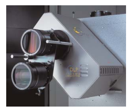
Unique, dust-proof digital head with twin anamorphic lens attachment

Electronic masking left, right, top and bottom. Independent left and right keystone correction. Correction of keystone distortion in up to 15% down or side angle